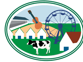
Bureau County Fairgrounds 1856