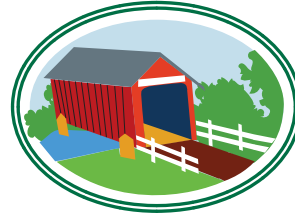
Red Covered Bridge 1863