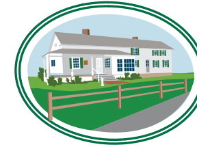
Owen Lovejoy Homestead 1838