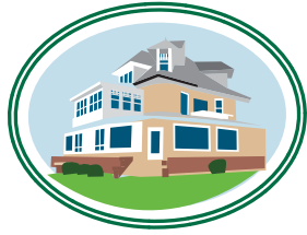
Bureau County History Center 1911